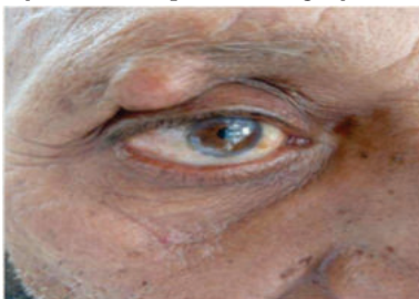
Fig 1 Showing Right Eye Upper Lid Mass

A 53-year-old male presented to our clinic with a chief complaint of a painless swelling on his right upper eyelid. The patient reported that the swelling had been present for eight years but had notably increased in size over the past year. The swelling was described as non-tender and had not caused any significant discomfort or visual impairment. The patient had no history of trauma or previous surgery in the area.