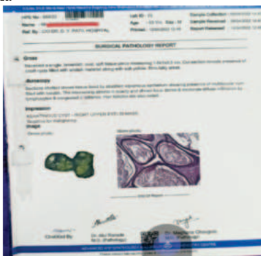
Histopathology Report of the Patient