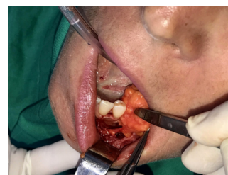
Fig. 3 : Intraoral view after surgical resection showing an intraosseous lipoma of mandible surrounding the inferior alveolar nerve.

No sign of recurrence was observed after six months of follow-up.