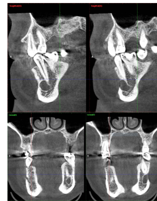
Fig. 2 : CBCT showing a solitary well-circumscribed lesion, with sclerotic borders, inside the inferior alveolar nerve canal. Note the canal and foramen enlargement.

CBCT (Fig.2). showed the presence of a solitary well-circumscribed lesion, round in shape, measuring approximately 10 mm in diameter, with sclerotic borders. Cross-sectional view illustrated a lesion inside the inferior alveolar nerve canal that cause canal and foramen enlargement, and penetrate adjacent soft tissue.