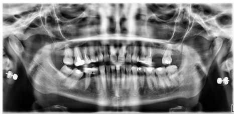
Fig.1: Orthopantogram revealing a well-defined, unilocular radiolucency in the left mandibular body, located adjacent to the foramen of the inferior alveolar nerve canal.

Orthopantogram (Fig.1) revealed a well-defined, unilocular radiolucency with sclerotic margins in the left mandibular body. The lesion was located adjacent to the foramen of the inferior alveolar nerve canal and entirely within bone. This radiographic appearance was suggestive of a contact between the lesion and the inferior alveolar nerve.