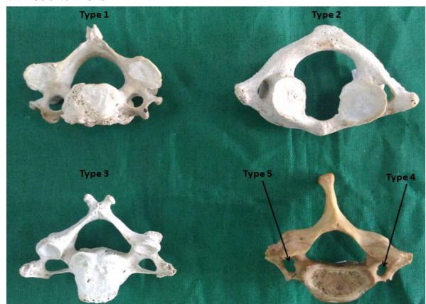
Table 2: Comparison of Studies on Foramen Transversarium by various authors