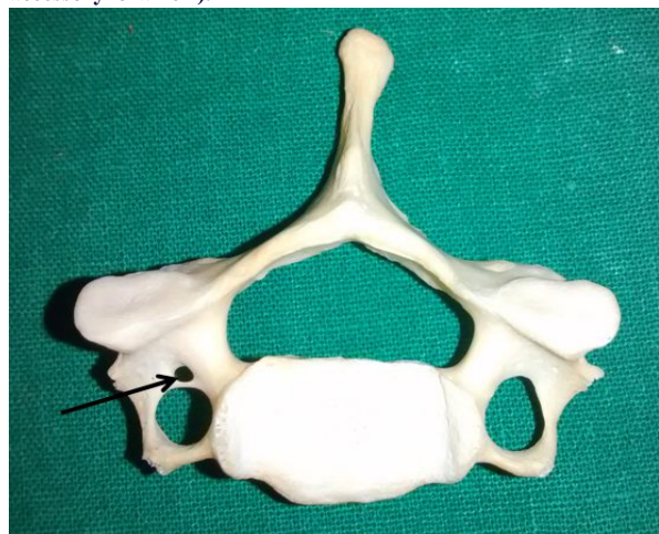
Fig 3 : Cervical Vertebra showing Right side Accessory foramen.