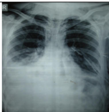
fig-2: CXR post ICD insertion.

On presentation, the patient was in mild respiratory distress with a respiratory rate of 30 breaths/min, a heart rate of 90 beats/min, and an oxygen saturation measured via pulse oximetry of 93% while breathing room air. A respiratory examination revealed the left-sided findings of reduced chest expansion, hyper resonance to percussion, and reduced air entry. Patient was referred from primary centre with preliminary treatment of