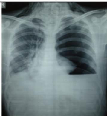
fig 1: CXR showing pneumothorax with subcutaneous emphysema.

A 18 year male presented to casualty with chief complaints of acute onset of breathlessness and chest pain following a bout of alcohol. He was transferred from primary centre with preliminary treatment of ICD insertion.