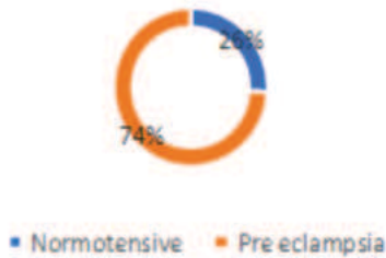
Figure1-Distribution of Participants among Comparison Groups

Figure 1 Shows Distribution of Participants among comparison groups. Participants were enrolled in 1:3 ratio. 52(26%) were in pre eclampsia group and 148(74%) were in Normotensive group.