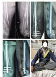
FIGURE-3 A.PRE-OP XRAY , B.IMMEDIATE POST-OP XRAY C. 6MONTHS POST-OP XRAY D.FUNCTIONAL ROM AT 6MONTHS

Excellent .....More than 85 points Good .....70 to 85 points Fair .....55 to 69 points Poor .....Less than 55 points