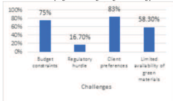
Figure 1: Challenges faced by architects while integrating green building practices

The survey reveals varying encounters with regulatory or policy hurdles, with a majority experiencing occasional obstacles, highlighting the complex regulatory environment in green construction. Interestingly, the least number of architects face policy hurdles, suggesting a relatively smoother policy landscape. The perceived high initial cost of green technologies emerges as a significant overarching challenge, aligning with broader concerns in the industry. This multifaceted understanding of challenges provides a nuanced view for shaping future strategies in green building practices.