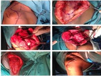
Figure 1. Operative Procedure

muscle under maximum tension as far medially as possible. The wound was closed over a suction drain. The arm was immobilised at 90° abduction and maximal external rotation by a Plaster of Paris slab during the initial postoperative period and later using a custom made aluminium splint for 6 weeks. After 6 weeks a radiograph was taken to check the transferred acromion and then progressive adduction of the shoulder was done over one week followed by isometric contraction training of the trapezius in contraction with rhomboids.