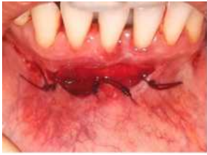
Figure 2: Vestibular extension done and Recipient bed prepared