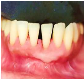
Figure 6: Healing after 1 month