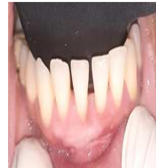
Figure 12: healing after 1 month