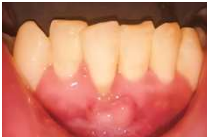
Figure 17: Healing after 1 month

The same surgical procedure, as mentioned above, was employed in all these cases.