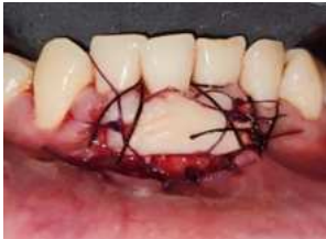
Figure 16: Suturing the graft to the recipient bed