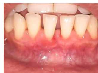
Figure 1: Pre operative view