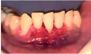
Figure 14: Vestibular extension done and recipient bed prepared