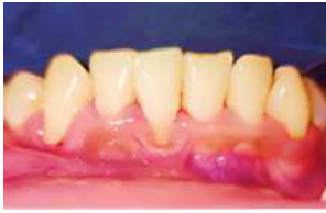
Figure 13: Pre operative view