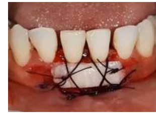
Figure 10: Suturing the graft to the recipient bed