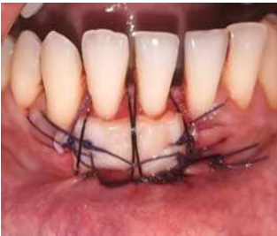
Figure 4: Suturing the graft to the recipient bed