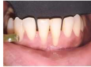
Figure 7: Pre operative view