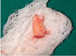
Figure 3: Free gingival graft