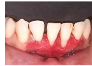
Figure 8: Vestibular extension done and Recipient bed prepared