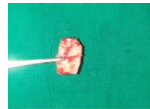
Figure 9: Free Gingival graft