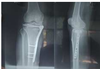
Figure 6. POST-OP X-RAY AFTER 2 MONTHS