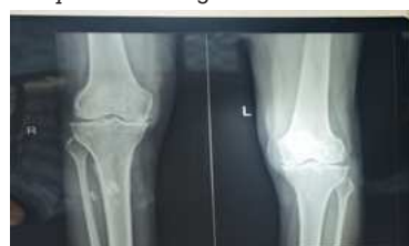
Figure 4. PRE -OP X-RAY Bilateral medial compartment osteoarthritis