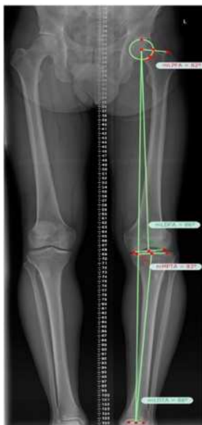
Fig. 1. A long leg radiograph of the left leg. A true AP projection of the tibiofemoral joint has been achieved. The Miculicz line from the centre of the femoral head to the centre of the ankle is shown. Measurement variables in the coronal plane are shown; mLPGA, mL DFA, mMPTA, mLDTA. Measurements obtained using TraumaCad®(Brainlab, Westchester, USA).

joint space opening of more than 5 mm on a weight-bearing long leg radiograph should be recognized as contributing to a severe varus deformity and accounted for [12]. A simple method to account for this is to measure the difference in lateral joint space width compared to the contralateral limb and subtract this from your calculated opening gap measurement.