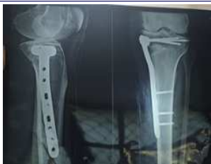
Figure 5. Immediate POST-OP X-RAY