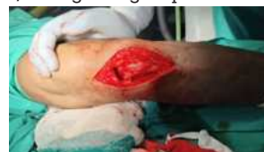
Figure 3. Intra Operative Image

Ensure with fluoroscopy when a long alignment rod or wire cable is centered over the hip joint and the ankle joint it lies at 62.5% of the width of the tibial plateau . Once the desired degree of correction is achieved, internal fixation of a metal plate is performed. There are various types of metal plates including the Puddu plate, Tomofix, Aesculap (dual) plate, - plates with or without a spacer (rectangular or tapered). Among these, spacer plates are most commonly used and the metal block should be identical to the calibrated wedge. The proximal fixation screws should be used under fluoroscopic guidance and the defect should be grafted using iliac crest autograft, allograft, or a bone substitute. For defects \geq 10 mm, corticocancellous autografts or allografts are used, whereas for small defects, bone grafting is optional.