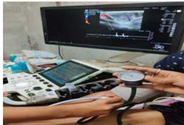
Figure 1: Measuring the highest systolic blood pressure for ABI with ultrasound linear probe in the right brachial artery.

arteria dorsalis pedis (ADP) and posterior tibial artery (PTA) was assessed by applying BP Cuff 5 cm above both the ankle joint. It is done in a sequential order of first right arm, then right ankle, followed by left ankle and left arm. Every SBP measurement was taken twice to rule out any discrepancies of > 10 mmHg which could be due to 'white coat effect'. Meanwhile, the highest value was taken into account. ABI Grading: Grade 0 (Normal)- 1.3-0.90, Grade 1 (Minimal)-0.89-0.60, Grade 2 (Mild)-0.59-0.50, Grade 3 (Moderate)- 0.49-0.26, Grade 4 (Severe)- 0.25-0.20 and Grade 5 (very severe)- 0.19-0.00. [12, 13] [Figure 1 and 2].