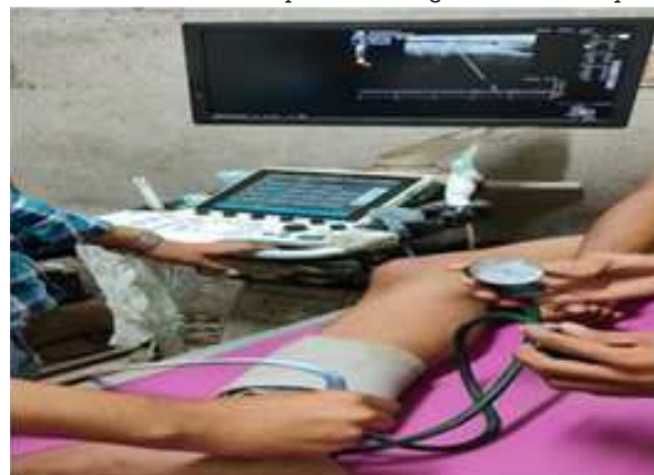
Figure 2: Measuring highest systolic blood pressure for ABI with ultrasound linear probe in the right posterior tibial artery.